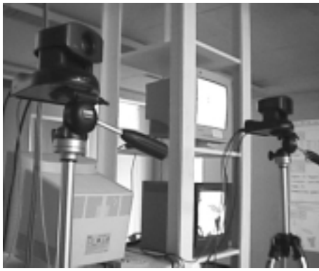
Figure 1. The ‘Talking Heads’ experimental setup with two steerable cameras capturing images of geometrical figures in front of them. Each camera is used by an agent in a grounded language game.

works. The agents have a lexical component based on a 2-way associative memory associating words with meanings and meanings with words. They play a game called the guessing game in which one agent tries to identify an object in the scene captured by a camera to another agent using verbal means. When the agents do not have sufficient categories or sufficient words, the discrimination trees or lexical memory expands.